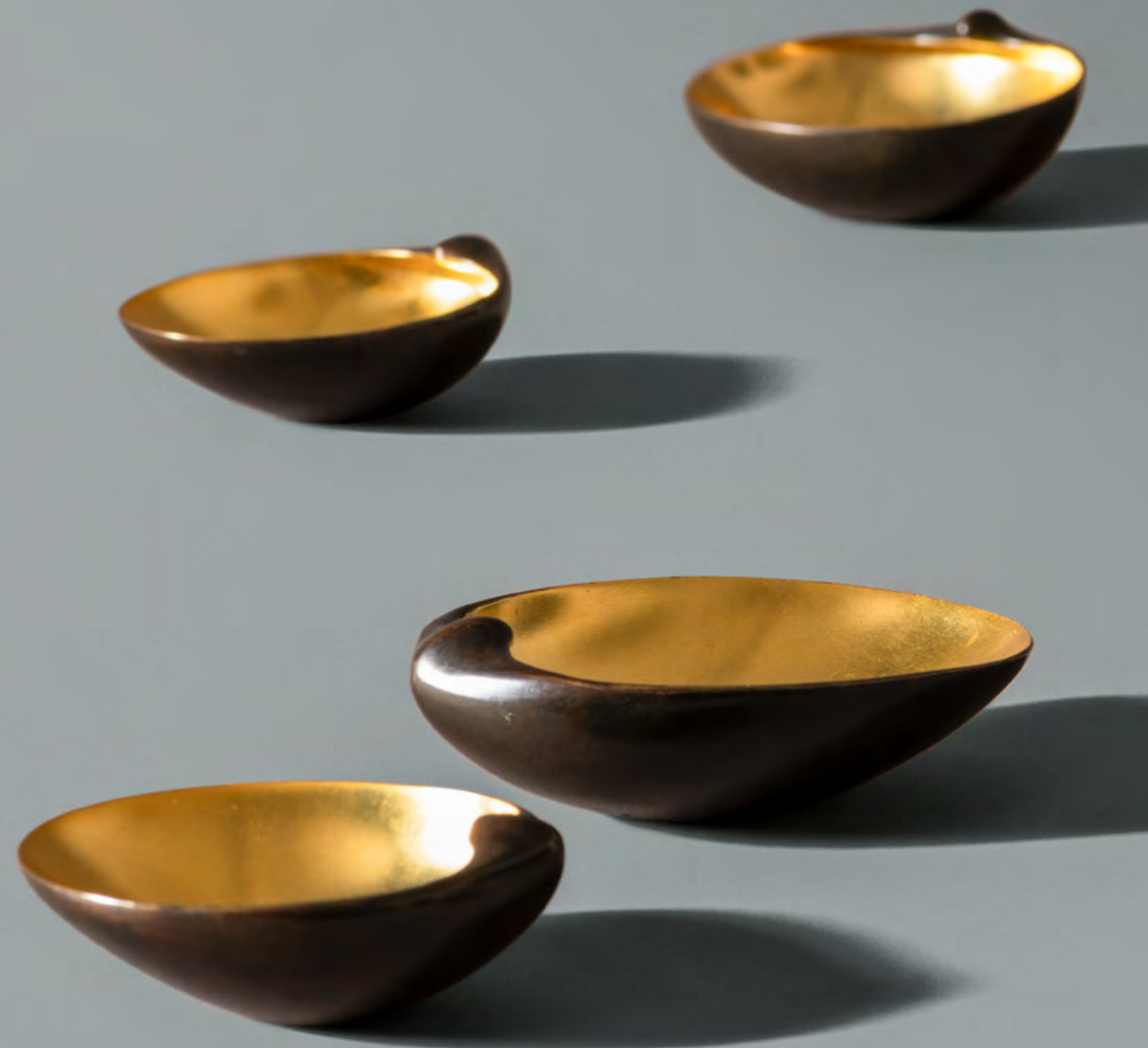
Studio Limited Series