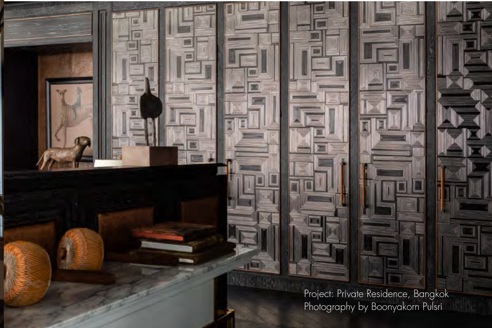
Project: Private Residence, Bangkok