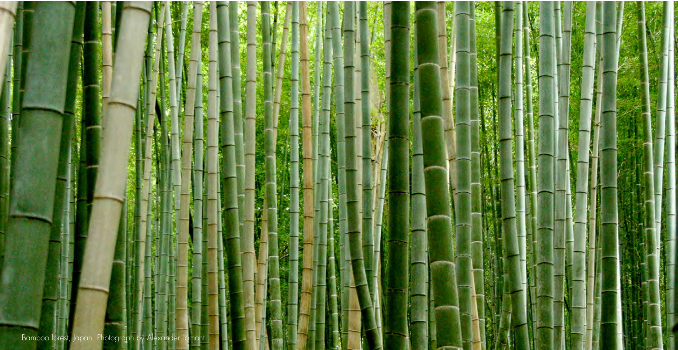
Bamboo forest, Japan.