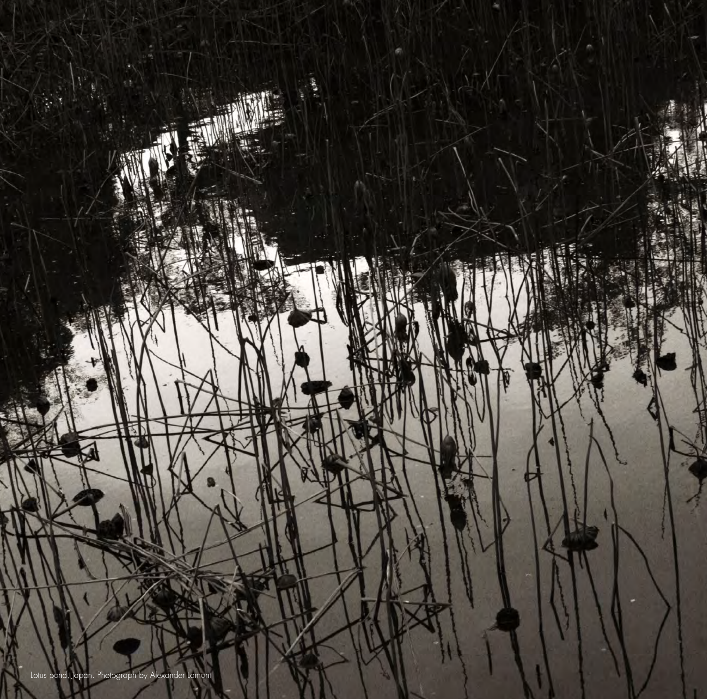
Lotus pond, Japan. Photograph by Alexander Lamont

"Designs infused with vitality, soul and character"